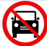
Detection for stopped vehicles in "No Park" area

Detects the presence of an intruder attempting to breach the physical perimeter of a property, building, or other secured area.